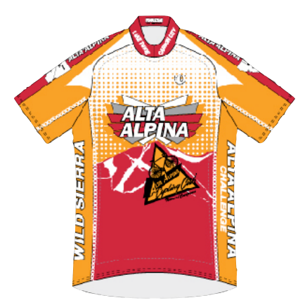
Red and Orange: Order from inventory. https://www.altaalpina.org/clubkit/