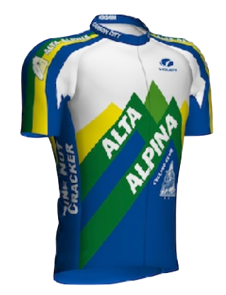
Yellow and Blue: Order from inventory. https://www.altaalpina.org/clubkit/