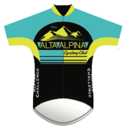
Fashion Kit: Order from inventory. https://www.altaalpina.org/clubkit/