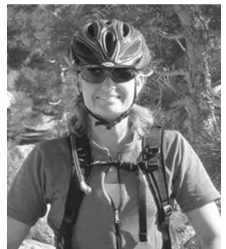
Taking a break coming down from the Flume Trail.

AACC Member since: 1998? Current Residence: Minden Immigrant from : the East Bay