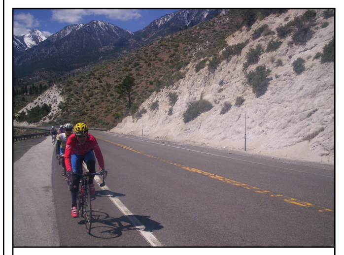
The group climbs Kingsbury Grade

May was a great month for weekend rides. We had lots of members with a diversity of riding speeds. With lots of regroups and refreshments at the end of the ride everyone had a great time. Here are some highlights.