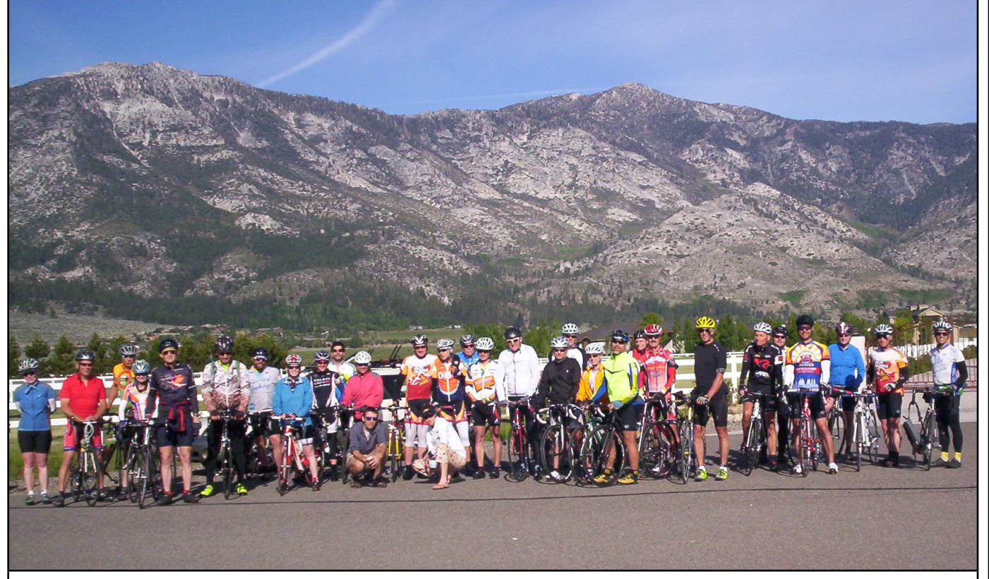
Start of the Spring Century