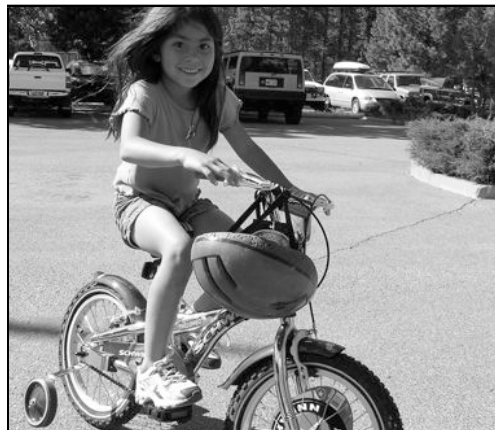
A big smile from one of the raffle winners.