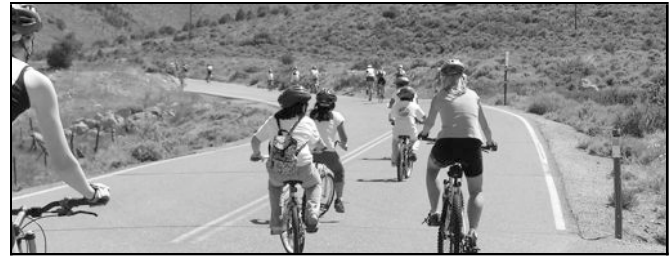
Now the tough part - riding UP the hill back to the school. At least there was a barbecue lunch awaiting the riders.