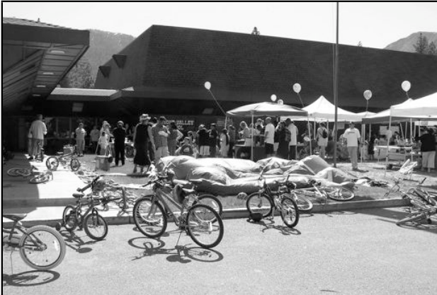
Before the start of the ride, a safety check was performed on each bike.