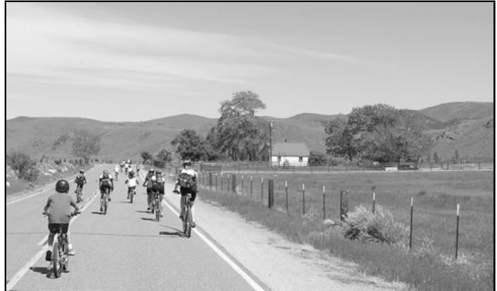
It was a mass start, as kids and their adult escorts started the descent from Diamond Valley School.