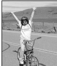
Elation at the turn-around point