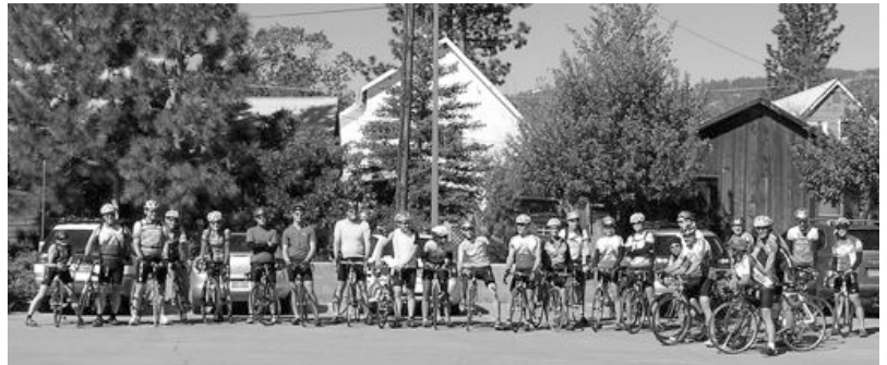
Markleville-Lake Alpine June 12

Sunday July 24, 2005 —Get that mountain bike down from the rafters, and head for the hills! It's an even numbered day, so we can ride the Rim Trail. We ride from the Ponderosa Ranch at Incline, up the old Mount Rose Road to the Tahoe Meadows, then south on to the Rim Trail and Tunnel Creek. Meet near the Ponderosa Ranch along Hwy 28 at 9:00 am. Riding time is about 6 hours with lots of climbing and technical terrain. Bring your camera and plenty of food and water.