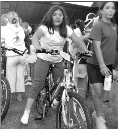
The most exciting part of the event was the raffle for 11 brand new bikes!