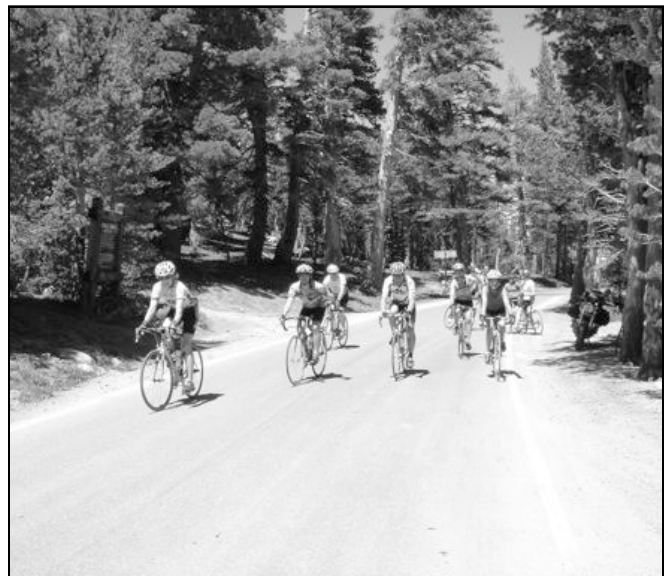
Using the Ride Board