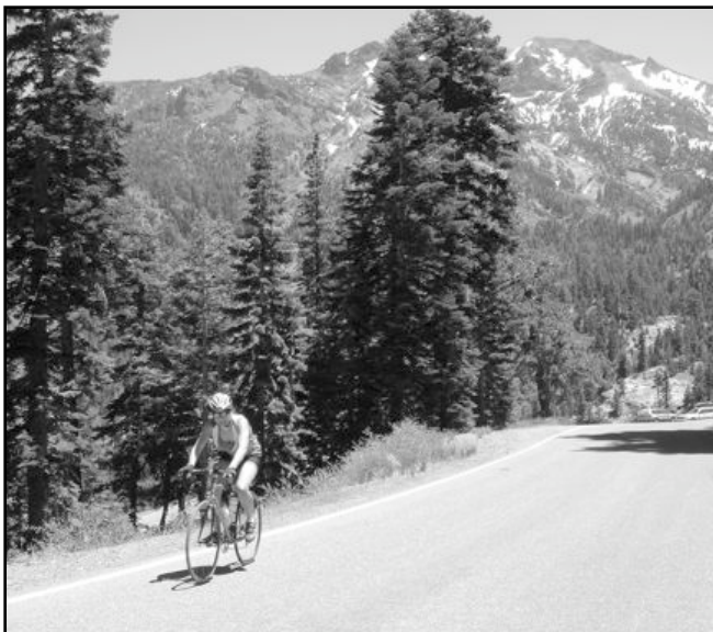
Without the Ride Board

Feel good about having led a ride! Our club exists to support people riding bikes together – thanks for stepping up!