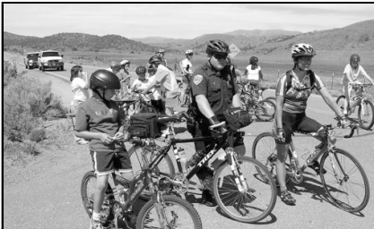
The rest stop 2.5 miles into the ride where fruit and water were available.