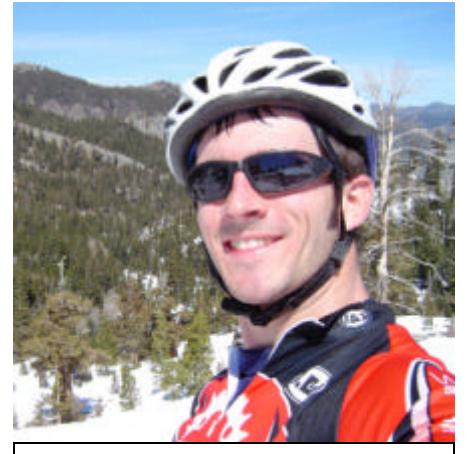
Ebbett's pass in the spring.